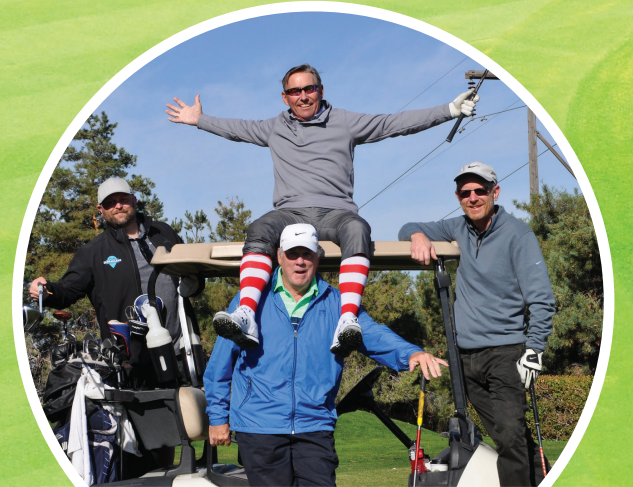
• Falcon Crest Golf Club, Kuna •

Ronald McDonald House Charities® of Idaho