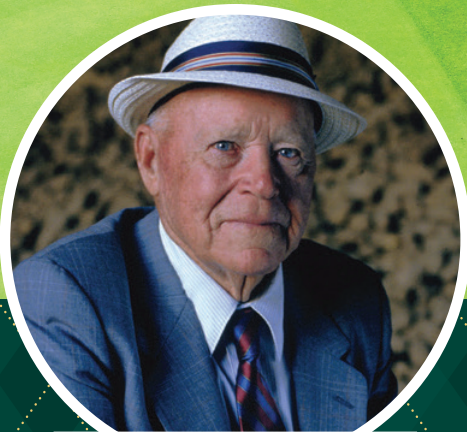
• The Inspiration •

Check-in: 8:00 a.m., Shotgun Start: 9:00 a.m.