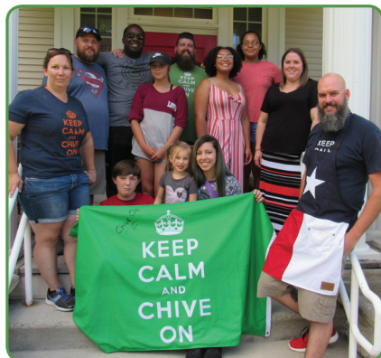
Chive Idaho volunteers prepared dinner, worked on projects around the House and yard work

During the summer there are more kids coming with their parents to volunteer. We love to see families volunteering together.