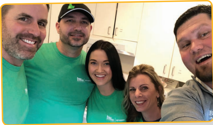
Better Homes and Gardens