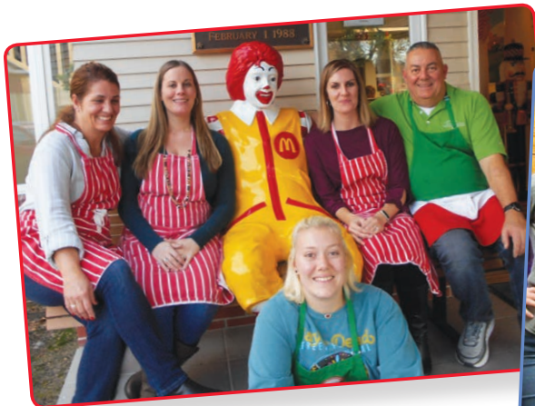
Mike Brown Group