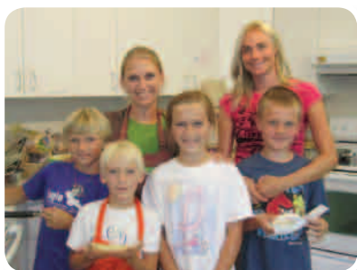
Cooper and Custer families prepared a wonderful chicken tortilla soup