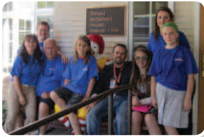
SW Airlines staff and their families after making a fantastic BBQ dinner for RMH families