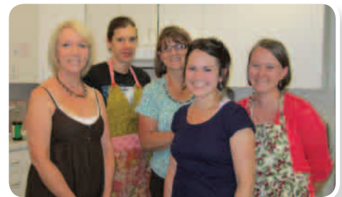
Morgan Stanley Smith Barney coworkers got together to prepare a much appreciated dinner