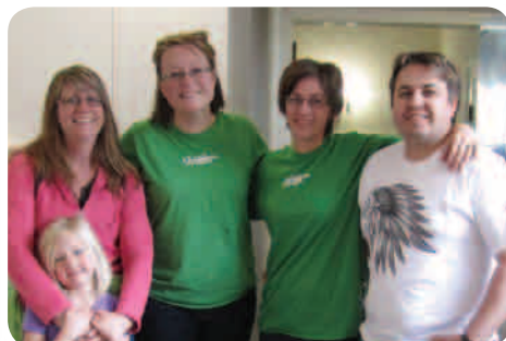
Starbucks crew prepared a delicious chili and cornbread dinner