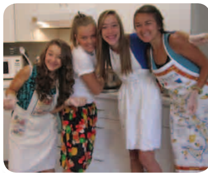
Eagle Nazarene Youth Group – had a great time listening to music and baking cookies