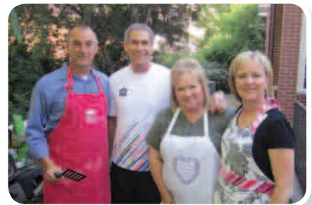
Wells Fargo team members prepared a BBQ for RMH families to enjoy